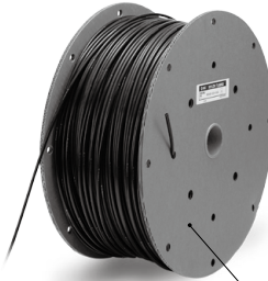
Reinforced corrugated cardboard

How to measure the minimum bending radius